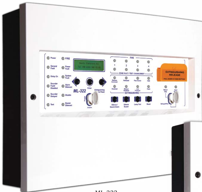
ML-322 Maxlogic Konvansiyonel Yangın Söndürme Santrali, 4 Algılama Bölgesi, 1 Söndürme Çıkışlı

Conventional series fire extinguishing control panel operates on cross-zone principle, has 4 detection zones and one extinguishing release output which is programmable according to the zone requirements. Conventional extinguishing control panel is microprocessor controlled, offers high performance and can easily be integrated into all extinguishing projects.