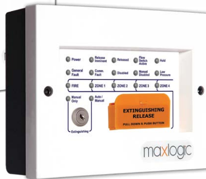
ML-3313 Maxlogic Konvansiyonel Söndürme Durum Gösterge Ünitesi